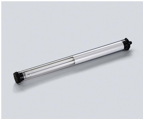
RL70CE - 136